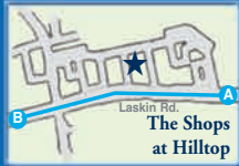
The Shops at Hilltop